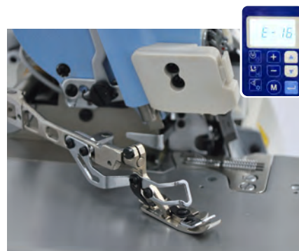
3. Presser foot arm with an open/close sensor