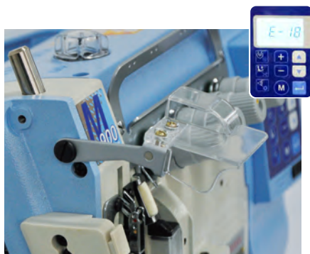
1. Eye guard with an open/close sensor

The cover sensor unit and cover microswitch unit that detect 1, 2 and 3 (shown below) are closed tightly during sewing, thereby preventing the sewing machine from starting up unexpectedly.