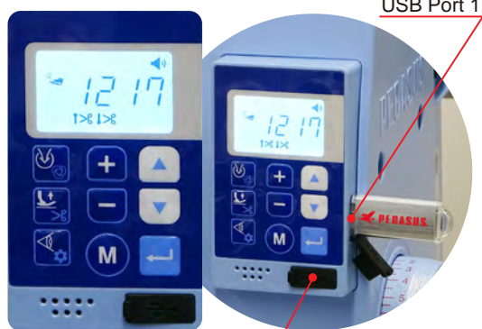
USB Port 1