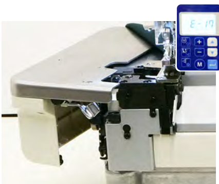
2. Cloth plate cover with an open/close microswitch